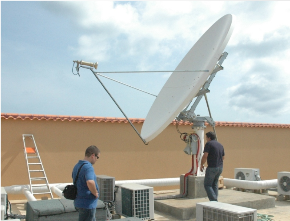
iDirect Broadband fixed VSAT terminal with General Dynamics 1385 C-Band antenna. The actual VSAT equipment required would be contingent to site location, satellite EIRP, frequency band and requested bandwidth.